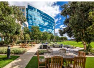
TOWERS AT SHORES

Redwood Shores offers the perfect mid-Peninsula location, ideally situated halfway between San Francisco and San Jose. This Class A collection has been completely transformed into modern, creative office space to attract and retain today's top talent. A campus-like setting features exteriors with all-new modern seating and collaboration areas including Wi-Fi, power outlets, bottle filling stations, bike share and more. Easy 101 access and a dedicated Caltrain shuttle connect commuters while Move-in-Ready Suites accommodate growing businesses who want to get right to work. You won't find high-quality, modern office space like this at a greater value. Get in before it's too late.