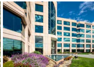
555 TWIN DOLPHIN