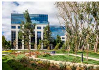
333 TWIN DOLPHIN