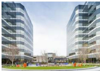
CONCOURSE 1731, 1735, 1741 & 1745 Technology Drive 224 & 226 Airport Parkway