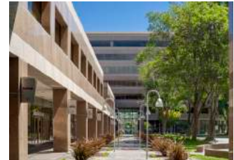
METRO PLAZA 25, 101 & 181 Metro Drive