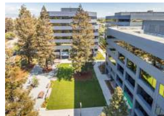
GATEWAY 2001, 2033, 2055, 2077 & 2099 Gateway Place