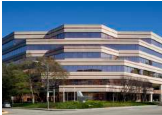
1740 TECHNOLOGY 1740 Technology Drive

Strategically located adjacent to San Jose International Airport in the heart of Silicon Valley, Airport Place isn't just a collection of Class A office properties. It's a convergence of industry-leading companies with the on-site amenities attracting talent and fostering creativity.