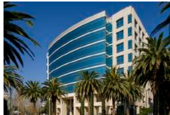
SKYPORT PLAZA 1650 & 1700 Technology Drive